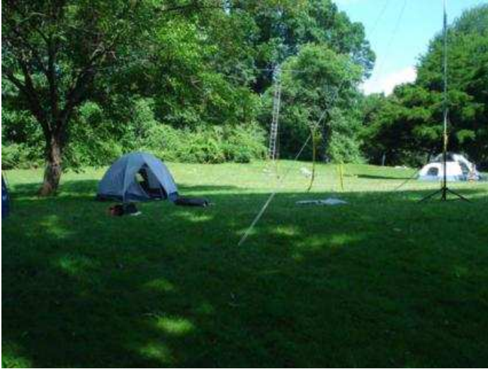
Larkfield Site in West Hills County Park