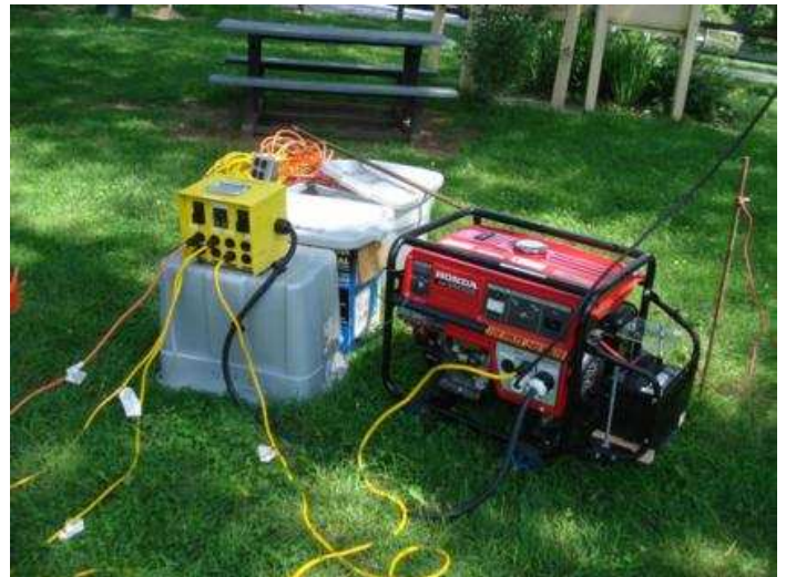
Generator and Distribution Center