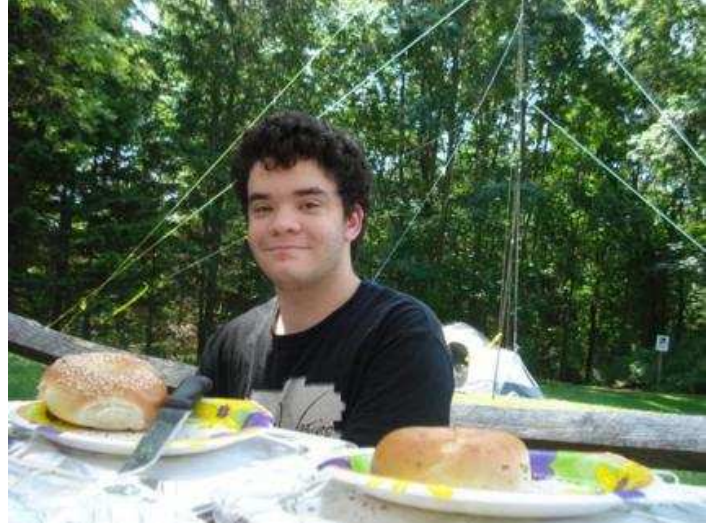
Happiness is Chowing Down Inverted “V” in the background