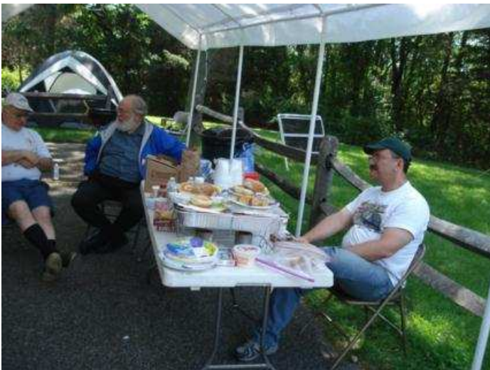
An Early Breakfast